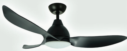
Full Black with Light Kit