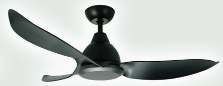
Full Black without Light Kit

*Specifications subject to change without notice *Picture illustration may varies with actual products supplied