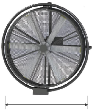
Diameter between 0.9m & 1.5m